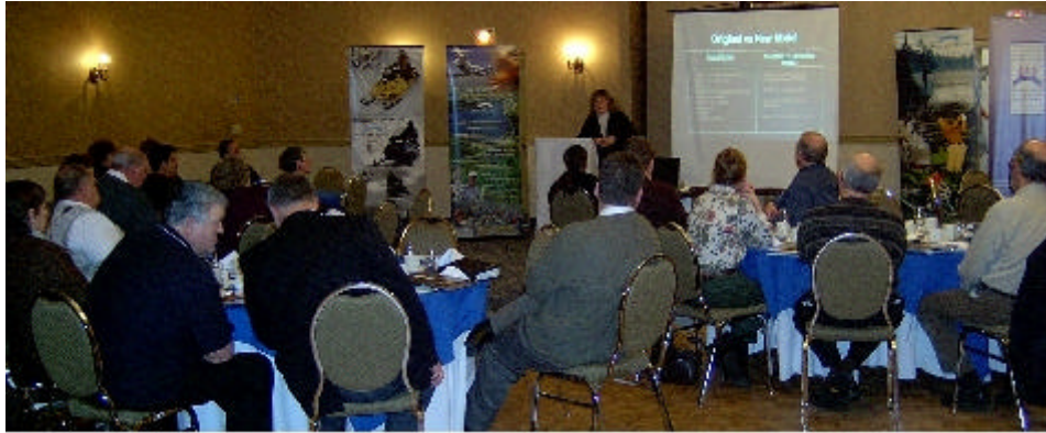
Community leaders at BSEGC and LTAB presentation.