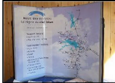
Blue Sky EGC's display at FONOM