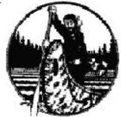
North Bay's Heritage and Tourism map is available at many area businesses

The first map produced by the group was a similar project focusing on the history of the Mattawa River. The proceeds of the North Bay Heritage Map will go towards the production of "365 things to do in the Blue Sky Region"