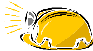
Mining week was May 12-17