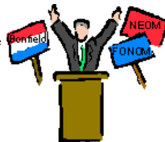
FONOM/NEOM 2003, a credit to the Township of Bonfield

Anyone who attended 2003 the FONOM/NEOM Conference would have to agree that Bonfield Township was phenomenal at FONOM, congratulations!