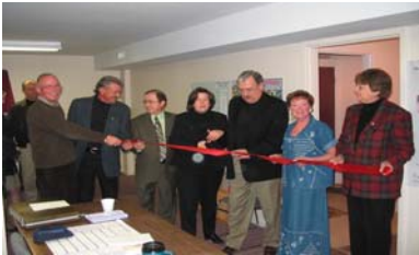
Ribbon cutting of the new Mattawa-Bonfield Economic Development Office